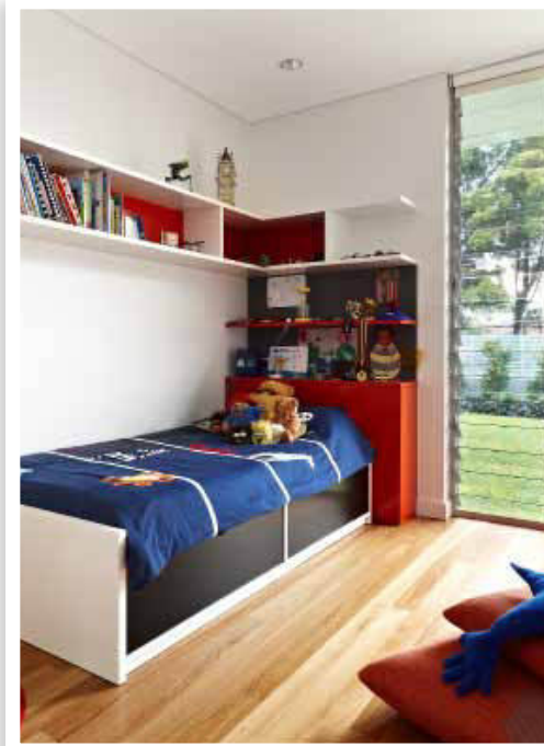
STYLING BY HANDE RENSHAW. INSET: PHOTOGRAPHY BY RHIANNON SLATTER. ALL PRICES ARE APPROXIMATE. ITEMS AVAILABLE ONLINE WHERE WEBSITES ARE QUOTED.