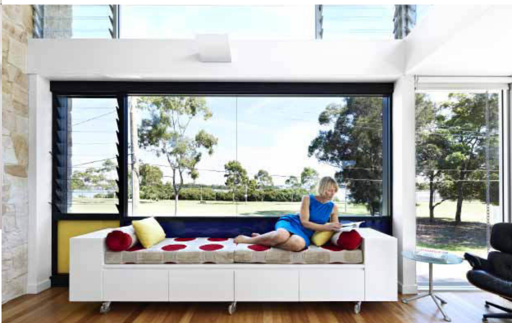
Top: The main living area with sliding doors opening onto the eight metre-long terrace, allowing cross-ventilation. Right: Anne relaxes in the upstairs living area. Above: The family are delighted with their new home.

5 Be smart when buying your furniture. All of our pieces are on wheels so they can be moved around different spaces for extra flexibility and all of the chairs and stools we own are stackable.