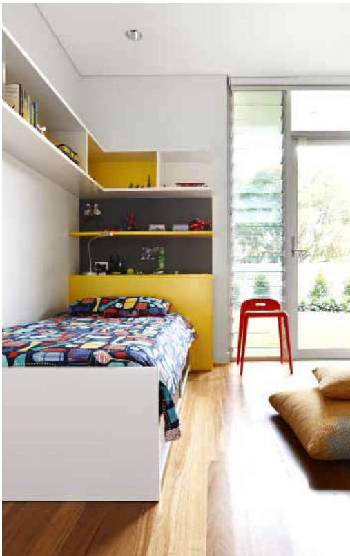
Above: Another of the light-filled boys' room on the lower level. Right: The stylish master bathroom comprises clean lines, a tiled splashback and a window that allows for light and ventilation.

time we started designing this house ➤ that chair was going to be hanging there,” she says. “With foresight, our builder was able to put in some solid timber sections to support it. It’s a lovely vista.”