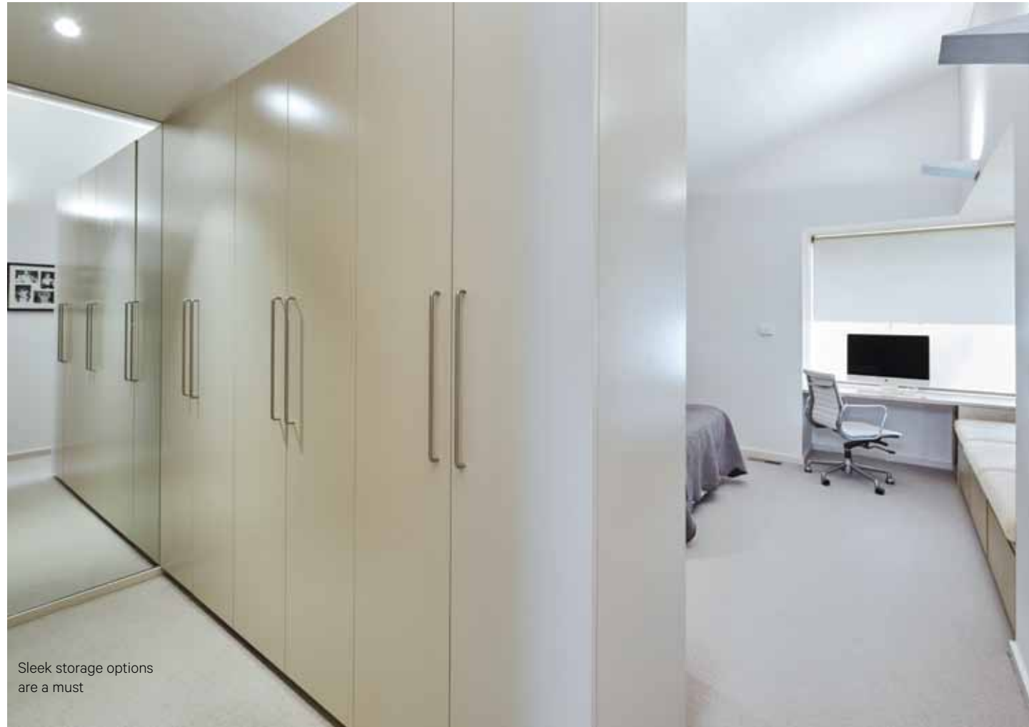
Sleek storage options are a must