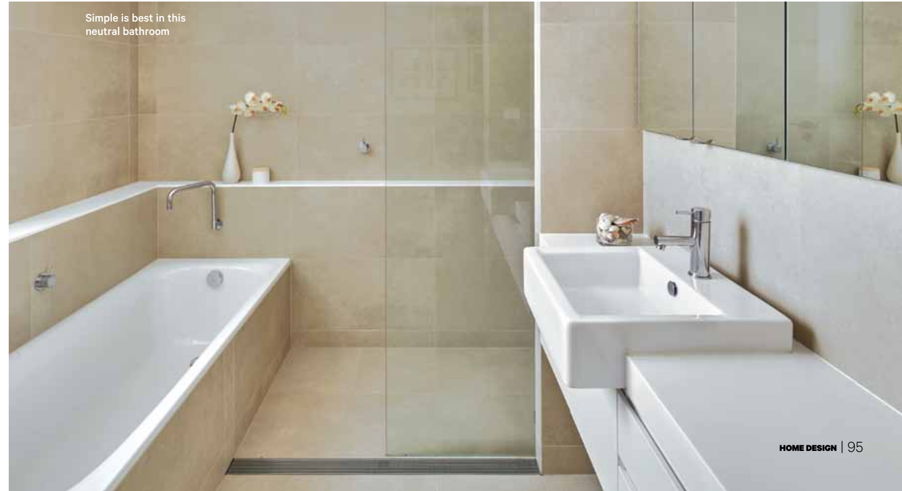
Simple is best in this neutral bathroom