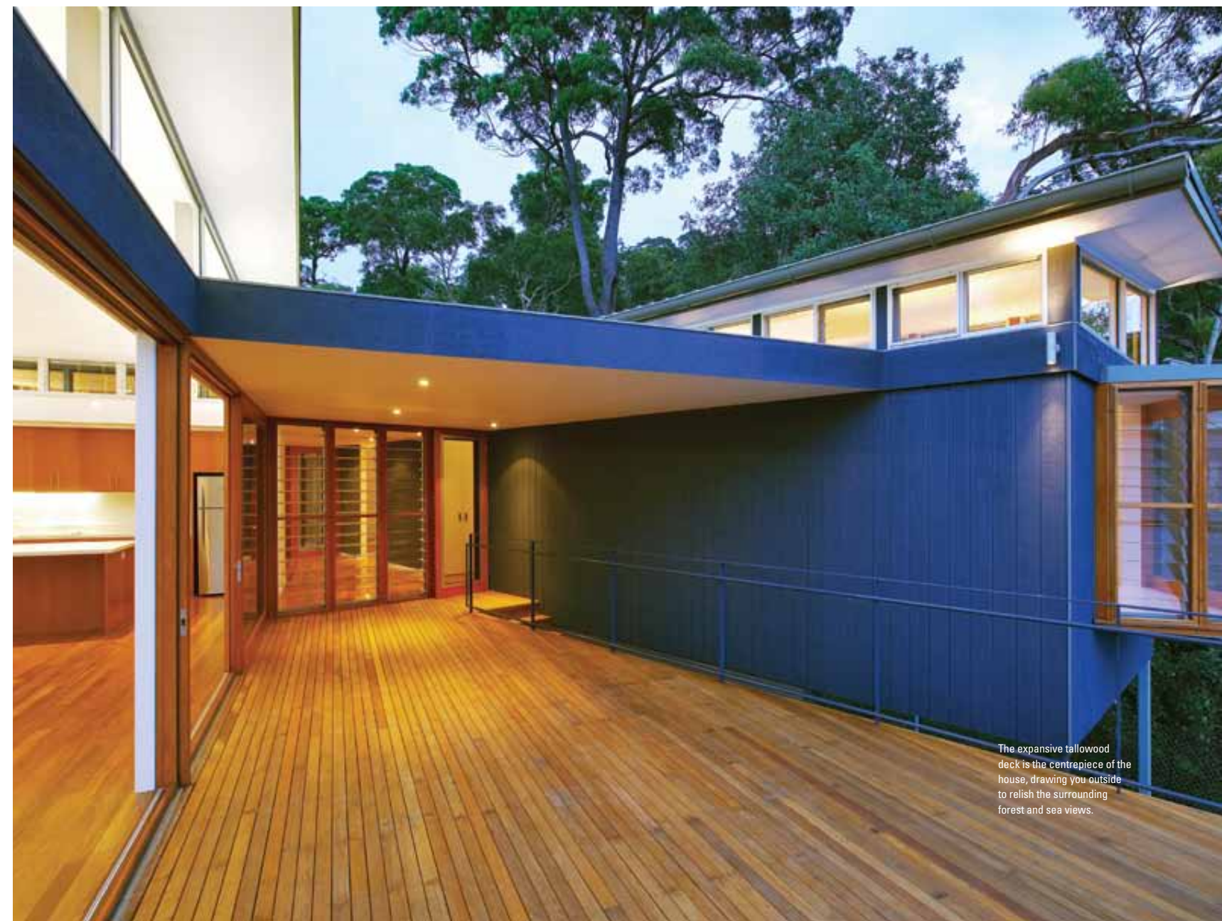
The expansive tallwood deck is the centrepiece of the house, drawing you outside to relish the surrounding forest and sea views.