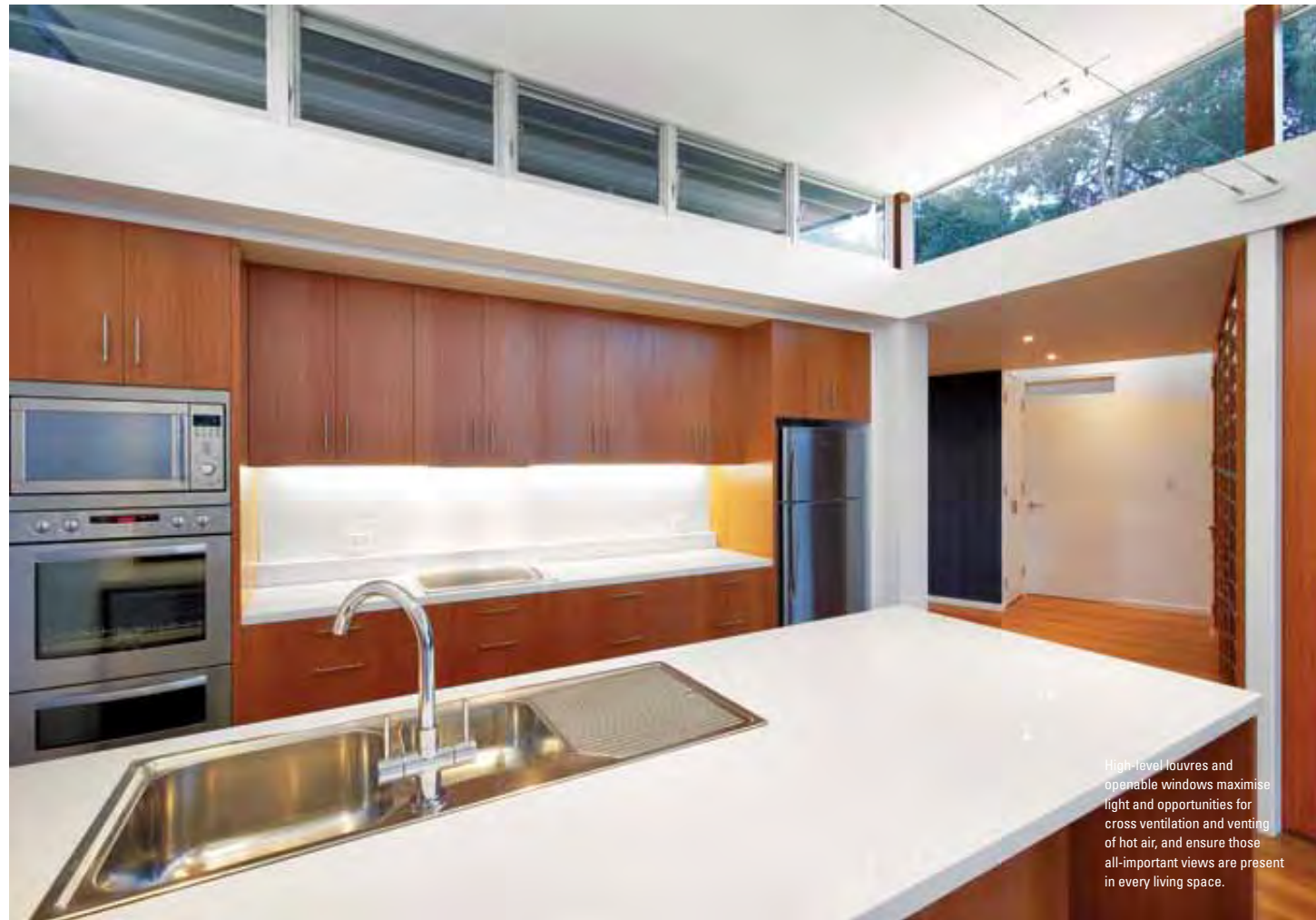
High-level louvres and openable windows maximise light and opportunities for cross ventilation and venting of hot air, and ensure those all-important views are present in every living space.

“The land is a small part of a property that was in my family for four generations”