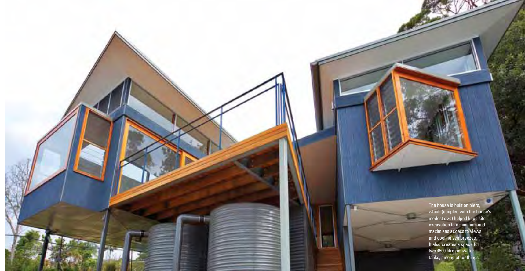
The house is built on piers, which (coupled with the house’s modest size) helped keep site excavation to a minimum and maximises access to views and cooling sea breezes. It also creates a space for two 4500 litre rainwater tanks, among other things.

Keeping the house size small was a priority, says the owner, to allow the block’s natural assets to feature. “It is only as big as it needs to be for our requirements,” she says. The 146 square metre house is miniscule in comparison to the 1500 square metre block that it occupies.